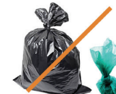
Trash & Pet Waste