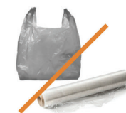
Plastic Bags & Wrap