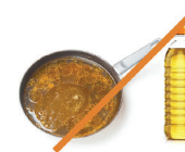
Fats, Oils & Grease